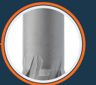
Tool body made from flexible steel alloy which results in fewer breakages & faster cut