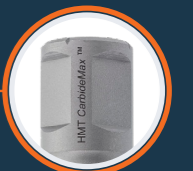
Standard Weldon Shank suitable for all magnet drills